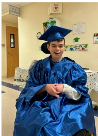
Bailey B LRTC 18+ 3/11/2024